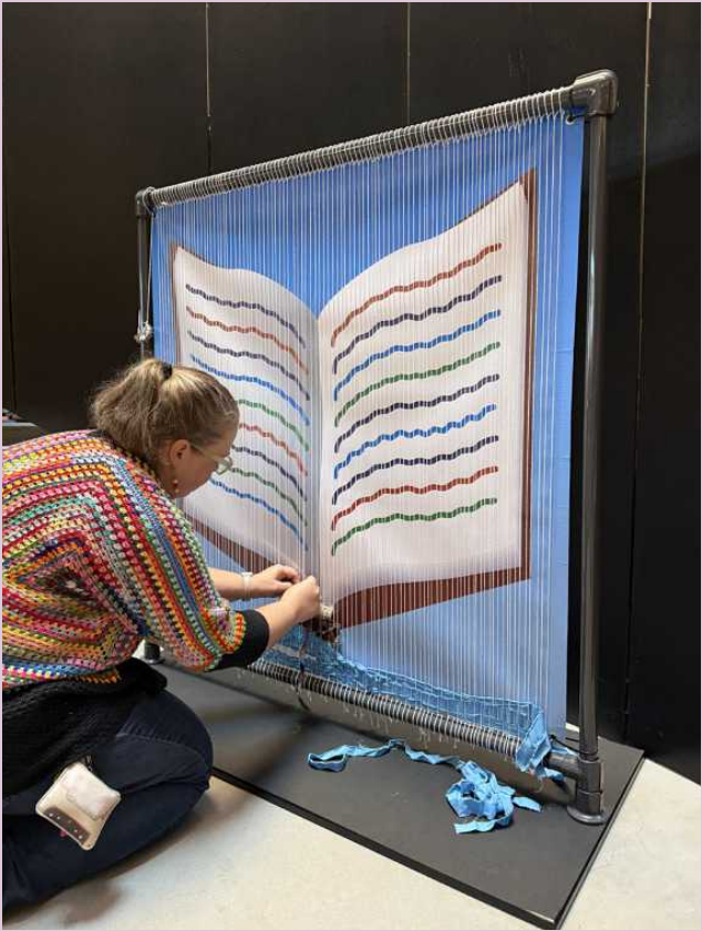
An ongoing community tapestry project will reach its culmination during the Winter Park Arts Weekend. WINTER PARK ARTS & CULTURAL ALLIANCE