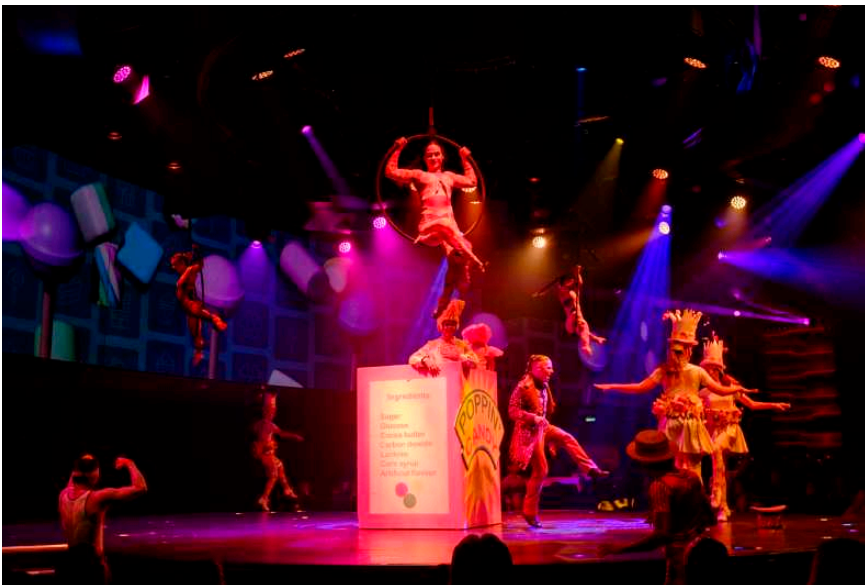
“Sweets” is one production found in the Carousel Lounge on MSC Grandiosa.