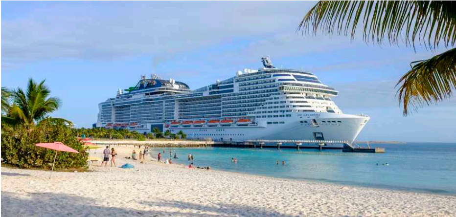
MSC Grandiosa is docked at Ocean Cay, MSC Cruises’ private destination in the Bahamas.