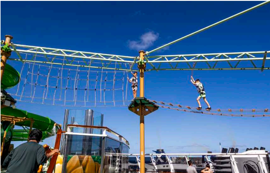
The Himalayan Bridge ropes course is a fun activity for families on MSC Grandiosa.

able and classy Sky Lounge for drinks overlooking the pool deck. Heading up to Deck 19, explore more outdoor family activities or exclusive areas reserved for MSC Yacht Club and Aurea guests. EXPERIENCES Cruise Critic’s 2025 Best in Cruise Awards named MSC Cruises as the best ocean cruise line for families, noting expansive kids clubs, varied menus and “multigenerational charm.” While MSC Grandiosa isn’t the first ship to have a ropes course, a splash pad or waterslides, those are all features of the ship that appeal to families when exploring outdoor options for play on board the ship. Inside, the bowling alley, F1 simulators, VR maze, sportsplex and Lego-themed kids club are all sure to be a hit. While the Grandiosa doesn’t have areas of the ship dedicated exclusively to adults, there are places to get away and relax. MSC Yacht Club and Aurea guests can enjoy an exclusive sun deck and whirlpool with great views on Deck 19. Yacht Club guests have even more exclusive privileges with a dedicated pool, sundeck, whirlpool and bar located forward on the top deck. The thermal area of the spa is also a great place for adult cruisers to unwind without the kids. Access saunas, steam rooms and whirlpools for full relaxation. The best experience MSC Cruises has to offer isn’t on the ship. Private destination Ocean Cay MSC Marine Reserve feels