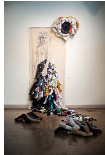
IMAGE: Elsa María Meléndez, (Puerto Rican, b. 1974), Adalicia en el país de los hardcorosos (Adalicia in hardcoreland) , Detail, 2009, Intaglio on padded and sewn paper, wooden box, 23 in. x 18 in. x 10 in. , Collection of the artist, Image courtesy of The Alabama Contemporary Art Center

Visit the Rollins Museum of Art(RMA) this summer to experience the exhibition Elsa María Meléndez: Vengo de una isla de confusión / I Come from an Island of Confusion . The exhibition, on view Thursday, June 1 through Sunday, August 27, includes a selection of three-dimensional constructions, soft textiles and large-scale embroidered pieces. Organized by l'Artban and the Rollins Museum of Art, it is the artist's first solo museum exhibition outside of her native Puerto Rico. Access RMA's website for more details on the exhibition and related programs.