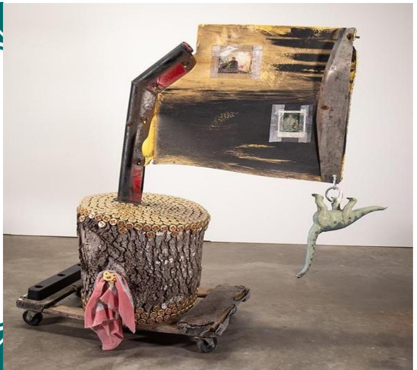
L: Portrait of Cruz Castillo. R: Cruz Castillo, 'Feed the Sculpture,' Mudflap hanger, found polaroids, tape, hitch ring w/ screw eye, toy dinosaur, beer bottle caps, nails, tree stump, personal bandana, son's pacifier, rubber dock bumper, dolly, 51 ½ x 42 x 21" (130.81 x 106.68 x 53.34 cm), 2025