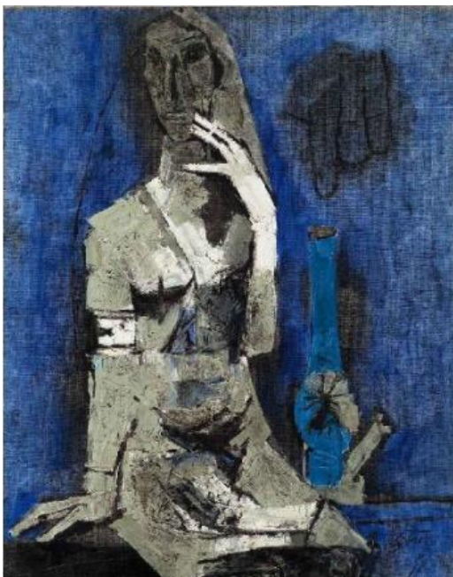
Maqbool Fida Husain, Virgin Night , 1964, Oil on canvas, 39 3/4 x 29 1/2 in. (101 x 74.9 cm). Grey Art Gallery, New York University Art Collection. Gift of Abby Weed Grey, G1975.158

All exhibitions will remain on view through December 31, 2022 . More below.