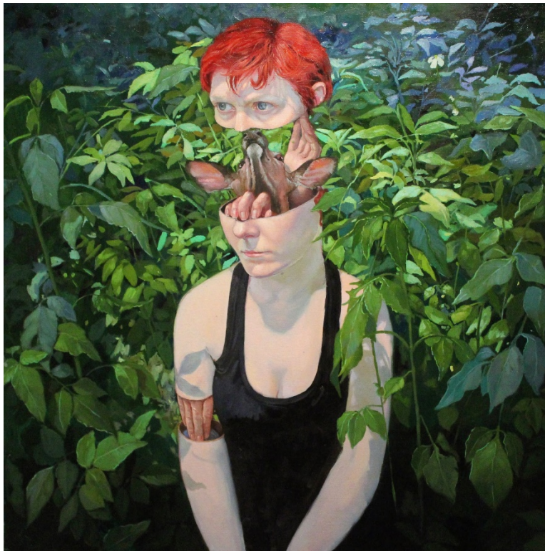
Dimelza Broche, Dear Innocence , Oil on Canvas, 24"x 24"