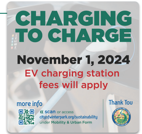
initial signs posted at EV charging stations

For more information regarding EV Charging Stations and connection fees, please access cityofwinterpark.org/evcharging . For questions please email sustainability@cityofwinterpark.org .