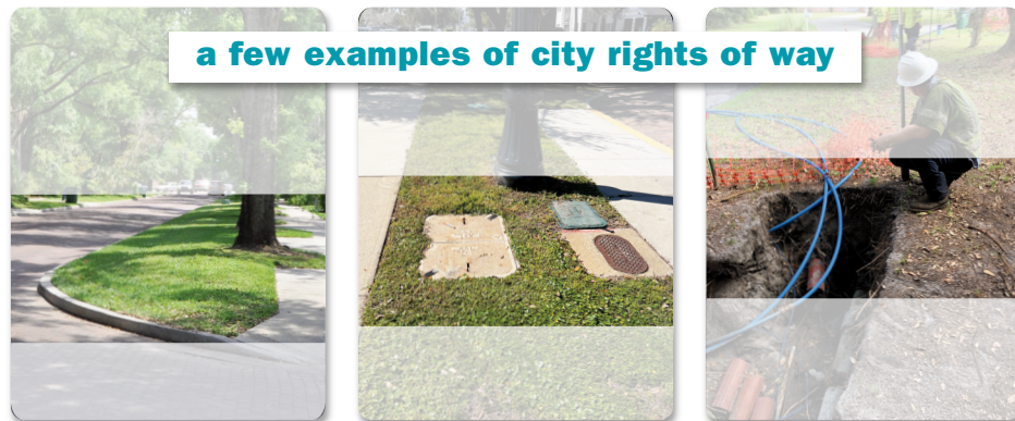
a few examples of city rights of way

electric transformers and cable boxes, or access to utilities such as water meters, are placed. Under the ROW are a number of conduits and pipes for utilities to run power, water, cable, fiber or phone lines to your home and/or business.