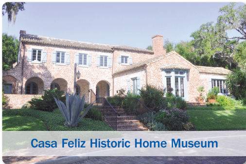
Casa Feliz Historic Home Museum