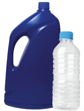
plastic bottles, jugs, tubs only