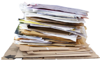
dry, clean paper only flattened cardboard