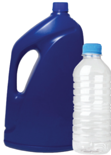
plastic bottles, jugs, tubs only