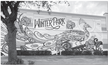
murals & lobbys