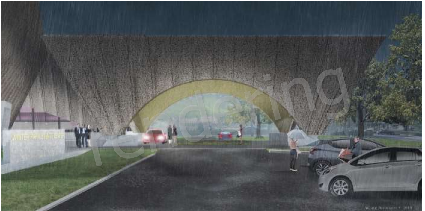
Porte Cochère – Add Alternate