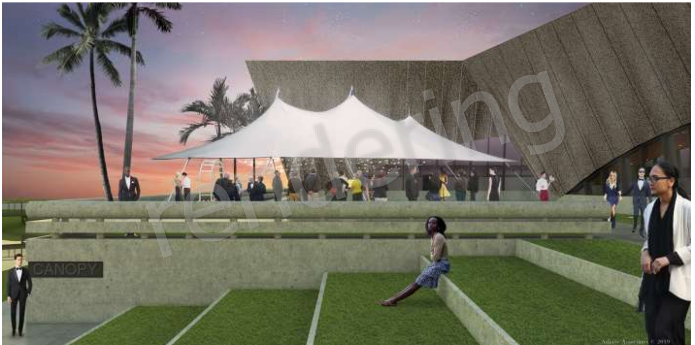
Outdoor event space & tiered seating leading down toward the amphitheater and lake's edge