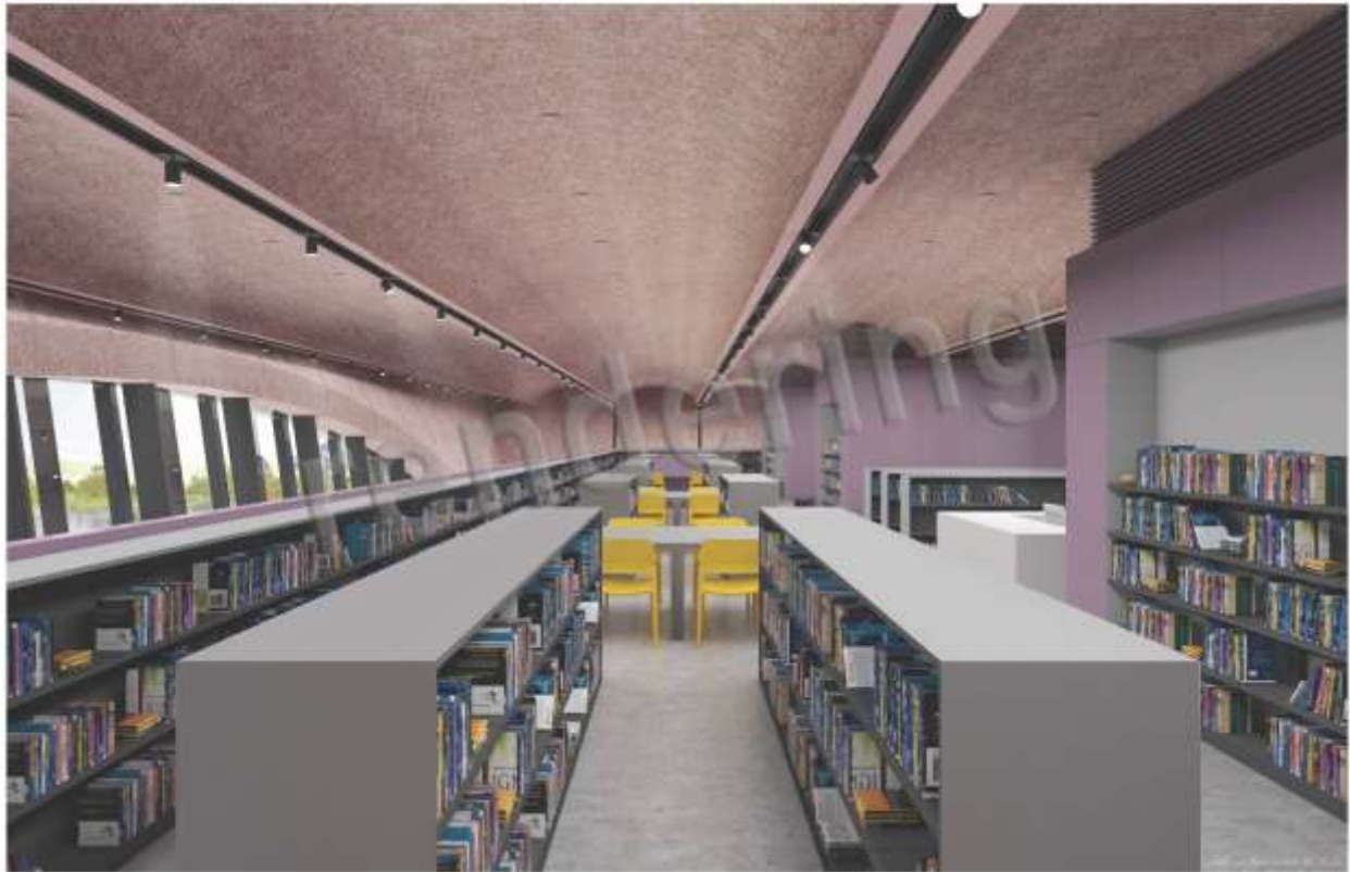
LIBRARY SECOND FLOOR