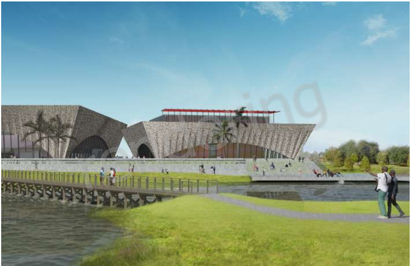
The Landing - outdoor amphitheater at the lake's edge – Add Alternate