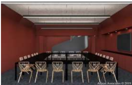
Oak Room (smaller meeting/event space)