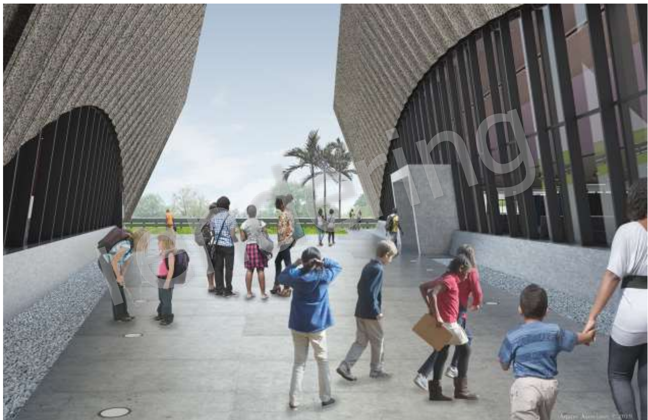
The Plinth - outdoor space between the library & events center