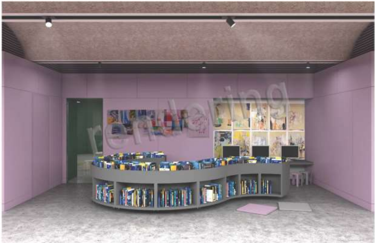
EARLY LITERACY AREA