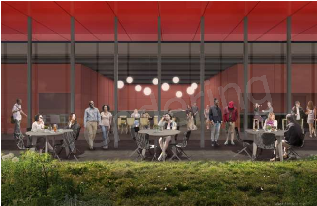
Rooftop Venue – Add Alternate