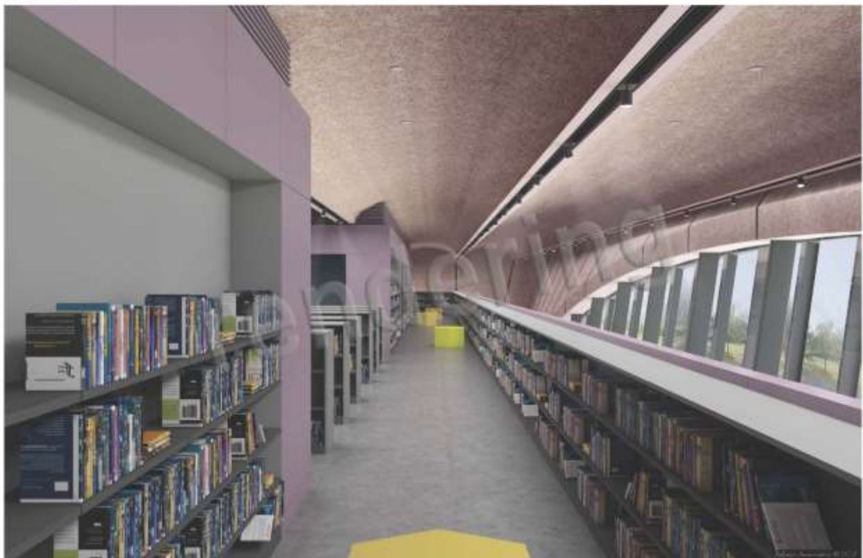
LIBRARY SECOND FLOOR