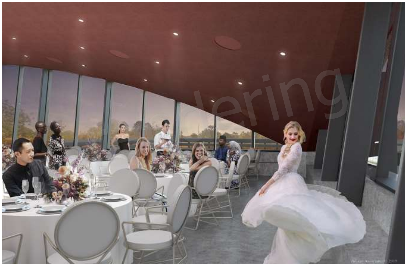
Grand Ballroom of Events Center