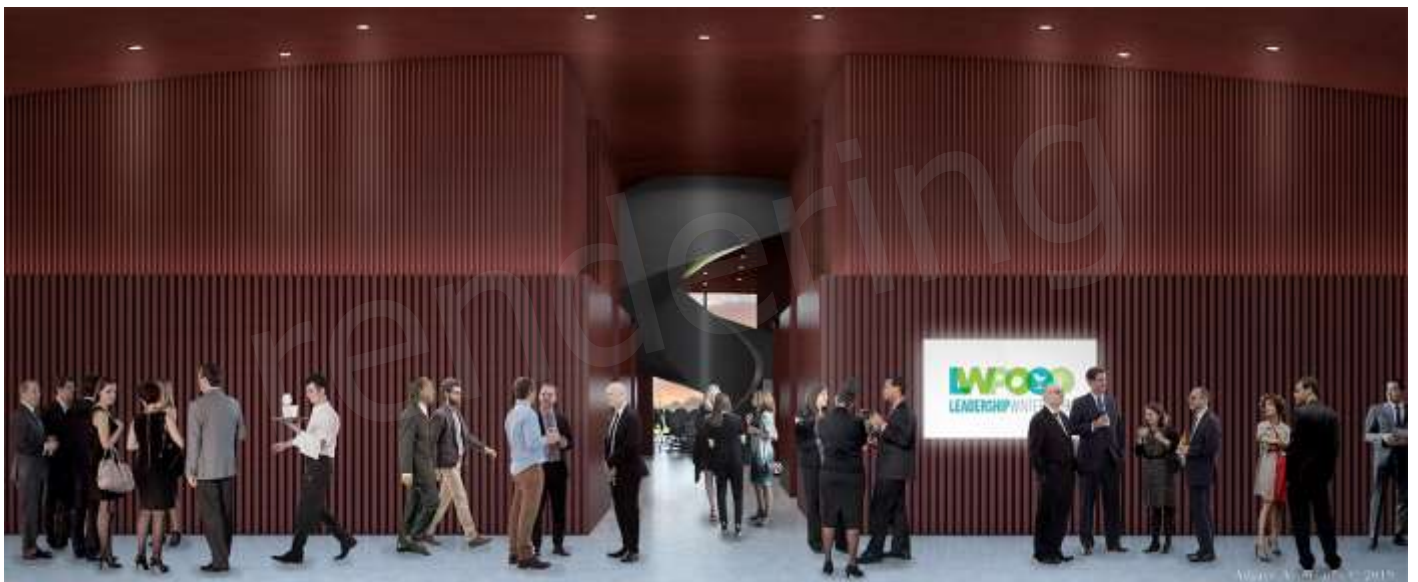
Lobby of the Events Center