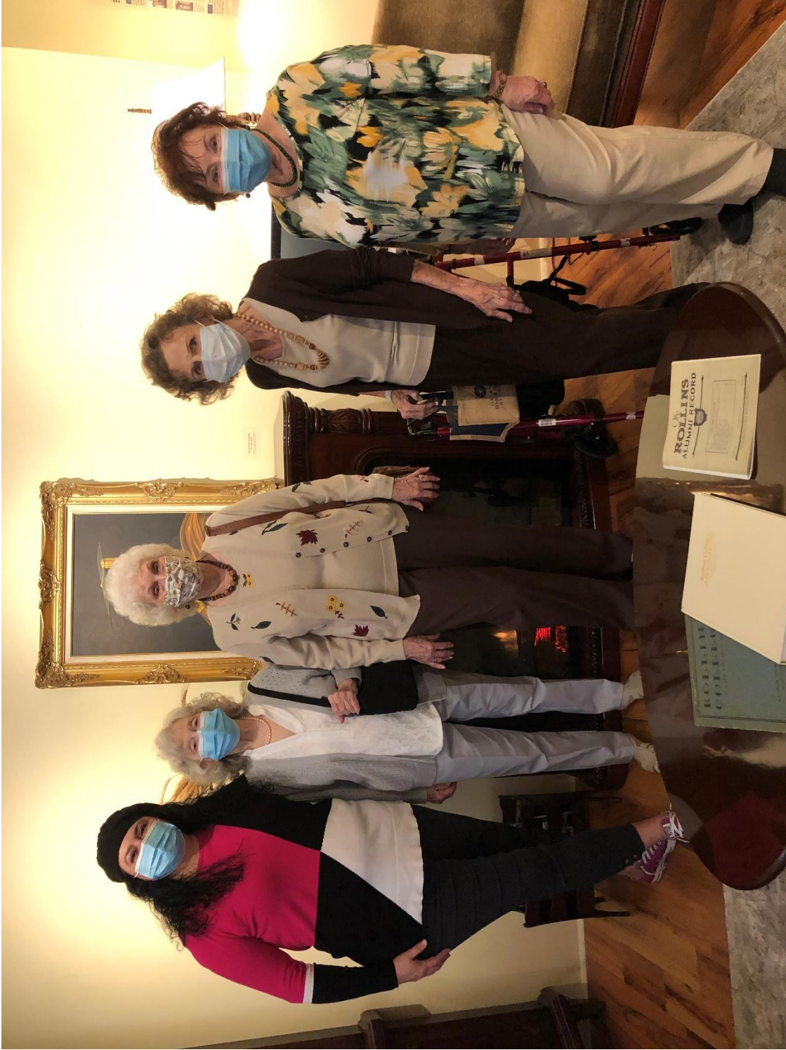
The Orlando Lutheran Towers tour group.