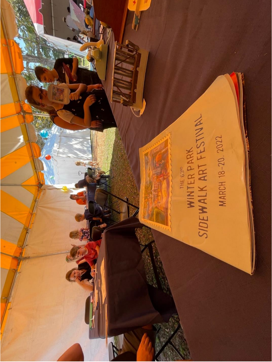
Kids crafted balsa wood planes and explored historical artifacts in our booth at the Winter Park Sidewalk Art Festival.