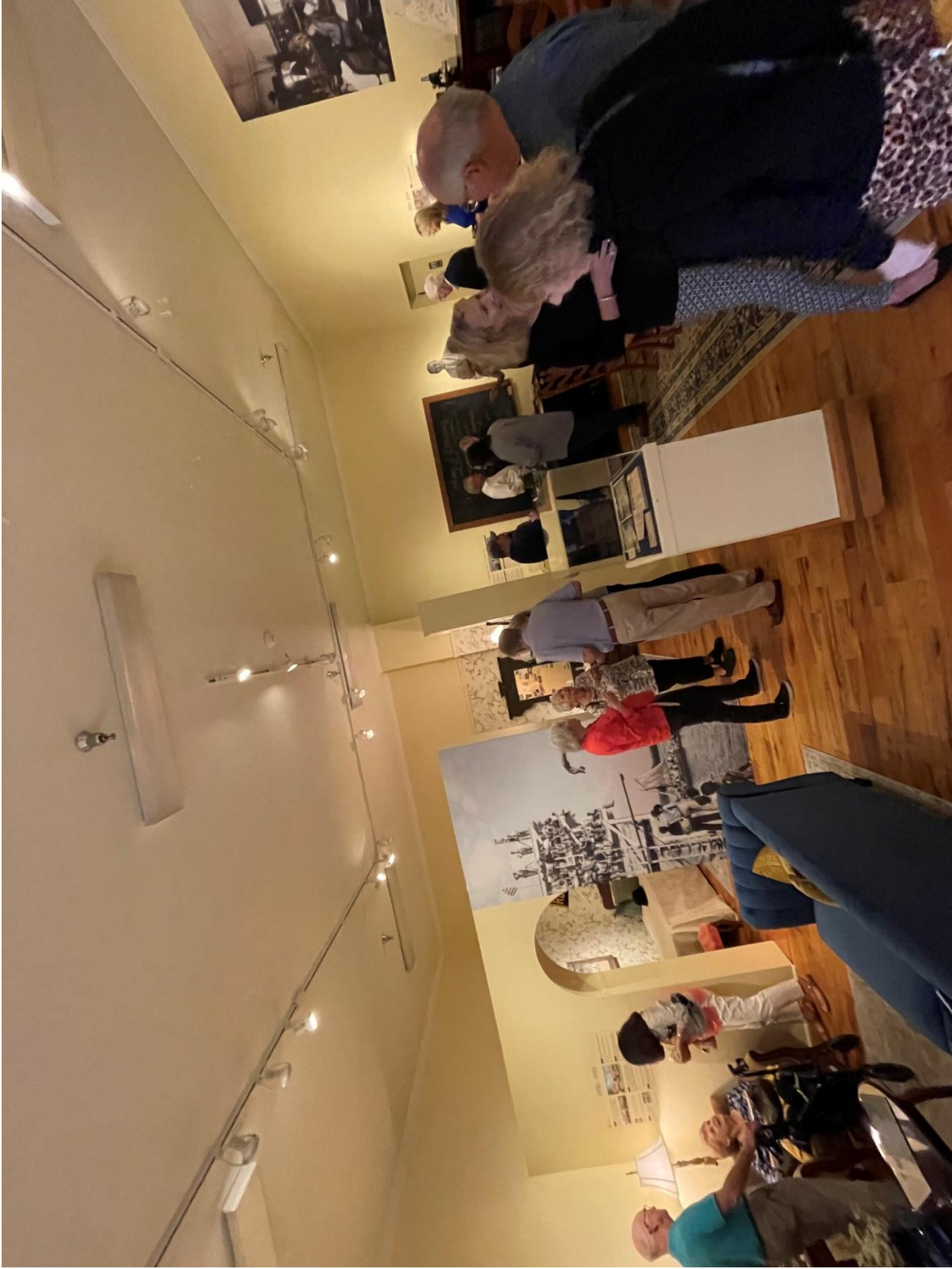
Our first member mixer was a hit! Over 30 of our members and donors came to see the exhibit. .