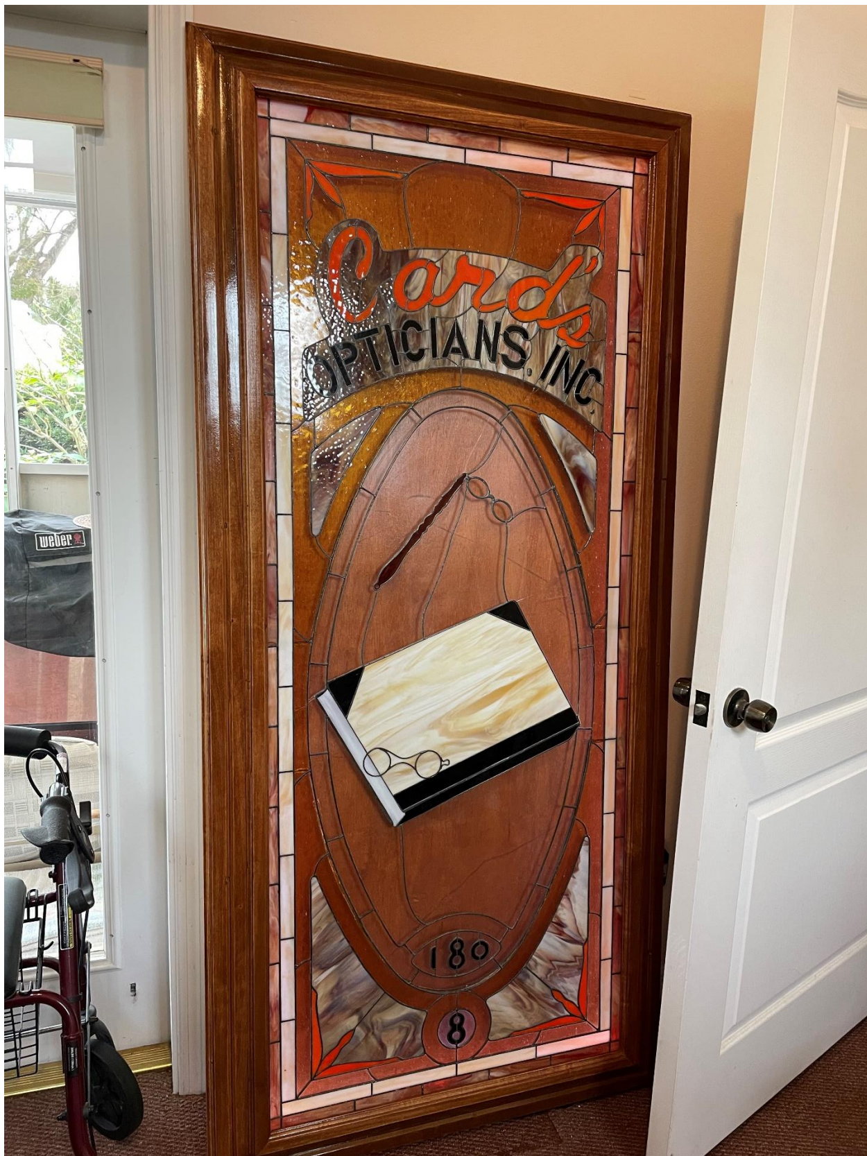
The WPHM added this door from long time downtown district store, Card's Opticians, to our collection.