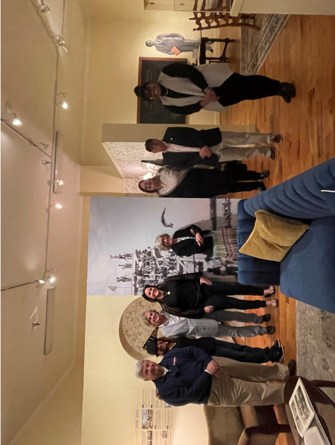
The WPHM provided a tour for the Rollins Alumni Board.