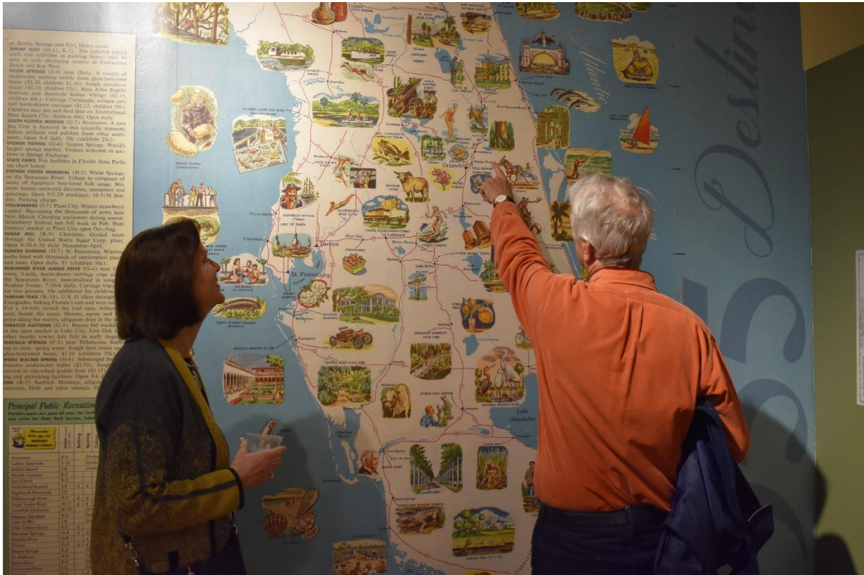
Grand opening attendee points out Winter Park on our reproduction 1955 map of Florida attractions as part the new exhibition Hello Sunshine! Selling Florida Through the Art of Postcards .