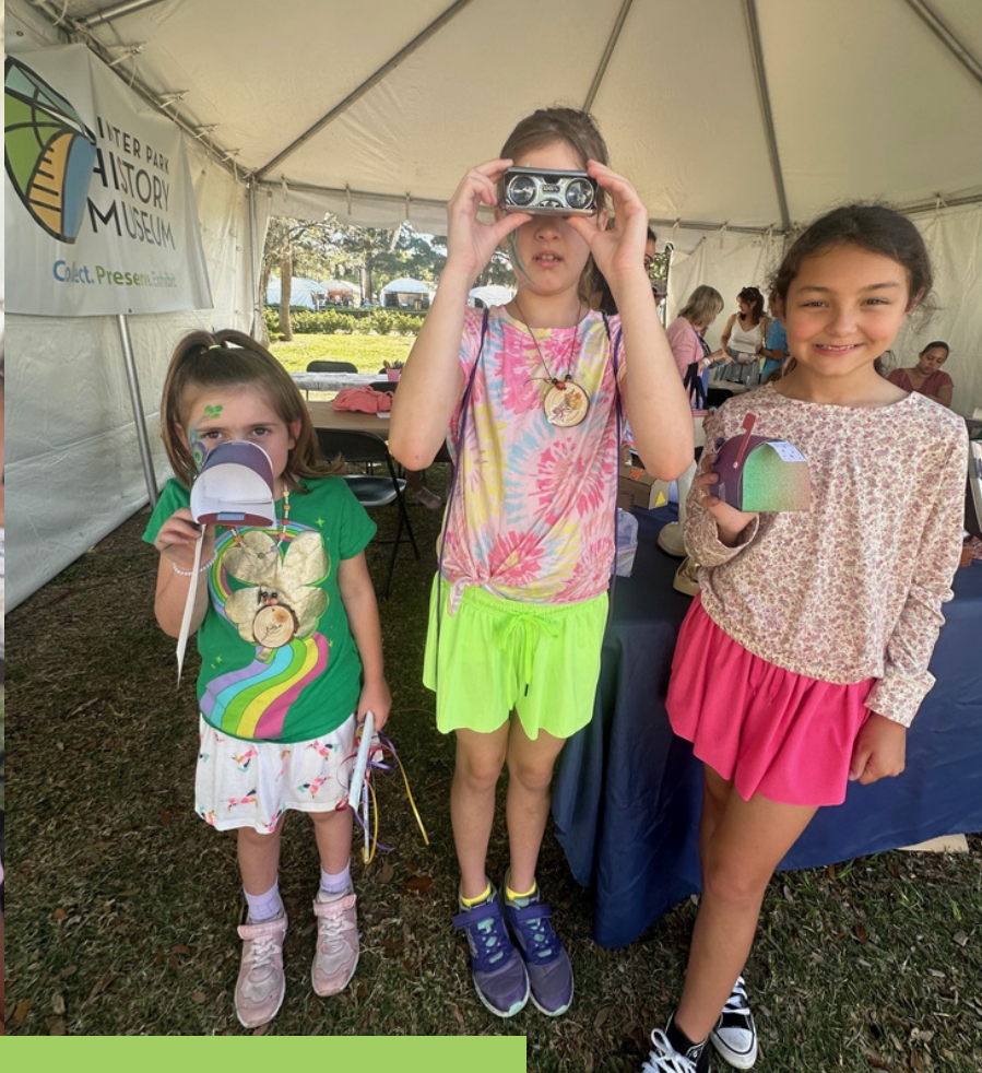
Kids enjoy the multiple crafts and our Hands on History display at the Winter Park Sidewalk Arts Festival!