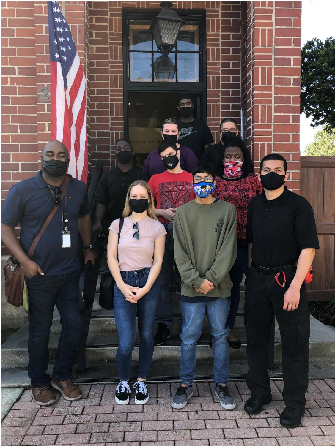
Students from the Orange County Vocational School visited the museum on December 17 th .