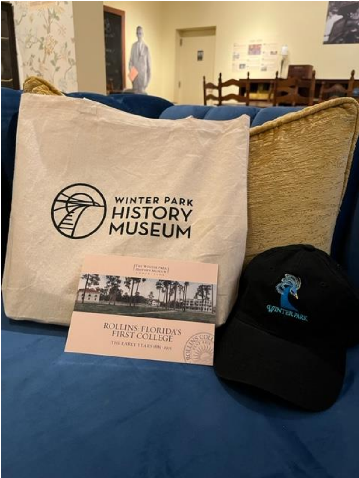
The WPHM debuted new gift shop items such as a canvas tote and a baseball cap.