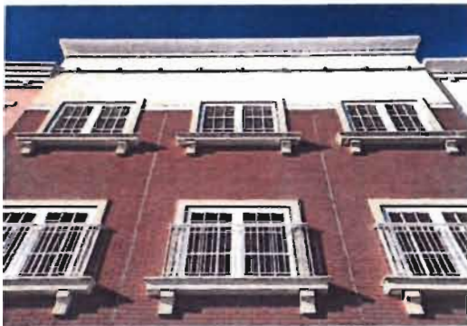
Exceptional window/opening treatments combine with cornice and color.