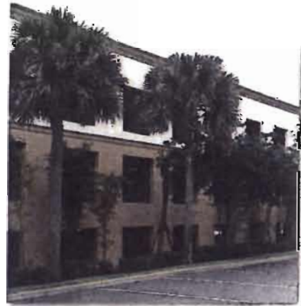
Landscape buffer screens an otherwise non-descript facade