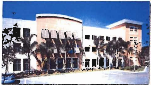
Awnings or shutters over upper floor opening create the look of an office building.