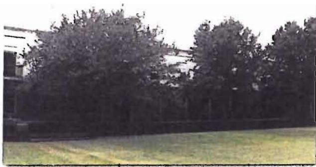
Mature oak trees screen the view of the garage

Below are pictures of successful examples within Winter Park where the use of landscaping/trees successfully screens the view of the parking garage by landscape elements.