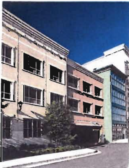
Articulation and color variation adds to the visual appeal.