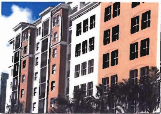
Building wall articulation (in's and out's) and color variation adds to the visual appeal.

In order to provide aesthetic interest, the exterior shall contain a variety of materials and colors. Below are some pictures that illustrate this done successfully of design elements not permitted.