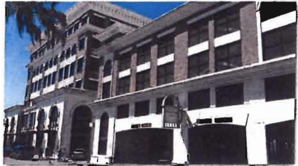
Bank of America parking garage on New England Avenue which successfully incorporates common architectural elements and design within two separated buildings as shown above and below.

One of the more successful examples of architectural compatibility is the Bank of America parking garage. These photos show examples of architectural compatibility done successfully (right)).