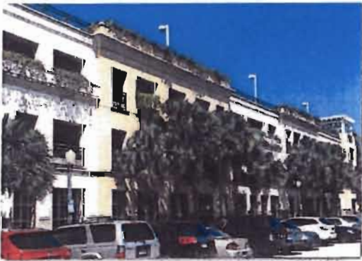
Landscaping is one element in attractive look of the Sun Trust garage.