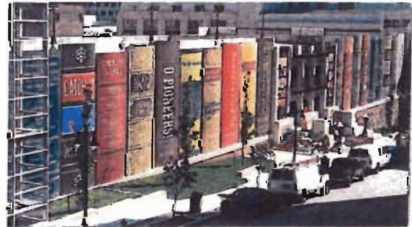
Kansas City Library which shows that a parking garage can look like anything you want it to look like.