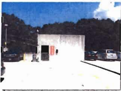
Unacceptable example with no architectural design elements.

These design guidelines shall require that the rooftop elevator and stair tower elements include architectural features such as pitched roofs, architectural materials in a fashion that compliments the overall style of the project/parking garage. Painting on the exterior of these elevator/stair towers can make a significant difference. Murals or artwork of a non-advertising nature are encouraged to be painted on the elevator stair tower interior facing walls in order to make the rooftop or interior parking garage environment more interesting and appealing. Below are pictures of the do's and don'ts for rooftops.