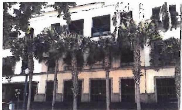
Cornice, expression line and larger ground floor windows resembling storefront windows add to the visual appeal.