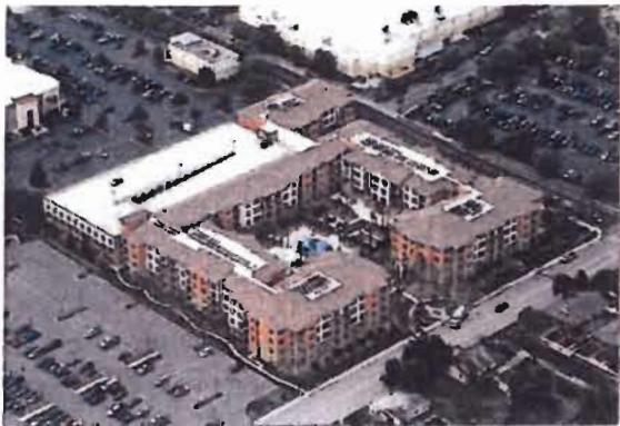
Location is not visible from public streets so the exterior façade may exclude design treatment.

In these types of circumstances and only in these situations, the City may, by specific approval, allow the use of more limited exterior façade design treatments than those outlined and required within these parking garage design guidelines. Designers should consult with the planning staff to determine whether the location criteria will apply that can result in less than a complete application of these design guidelines. Otherwise for parking garages facing public streets or visible thereto, the mandatory design elements within the guidelines shall be required.