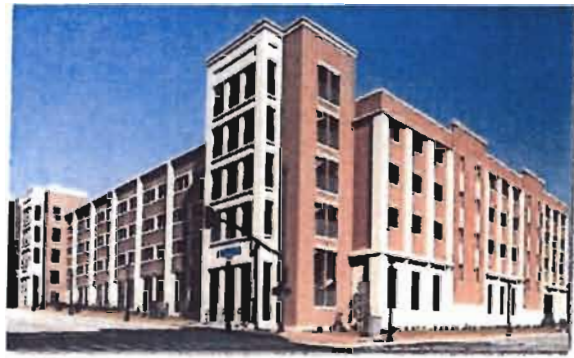
Successful articulation, color variation and window treatment for openings.