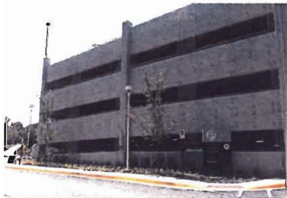
Example of cost being the sole design motivation

A parking garage is typically a precast concrete panel structure. If one does nothing to cover or screen the “bones” of the parking garage, then the result is parking garages that look like these pictures.