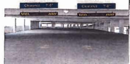
Above & below right: Note painted columns and side walls.