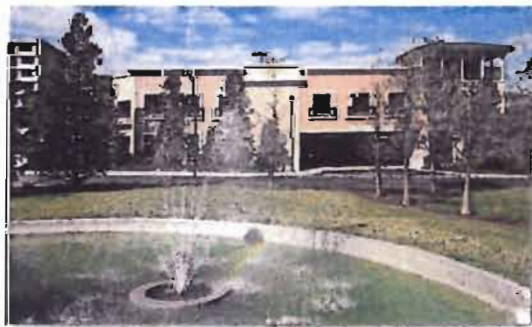
WP Towers garage with cornice, articulation, stair tower, window fenestration, planter boxes and opening framing details combine successfully.