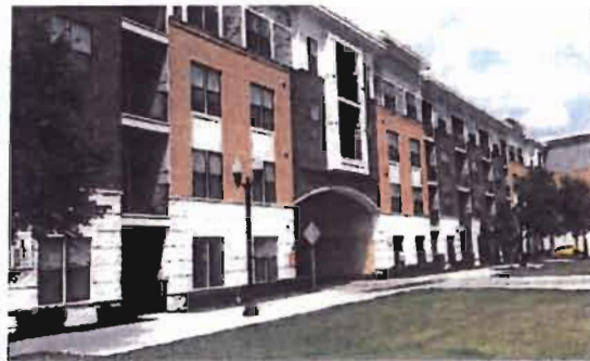
Steelhouse Apartments on Colonial Drive with parking garage shown in the photo to the right.