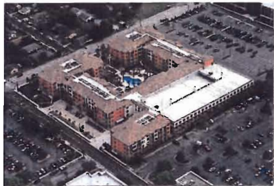
Interior location minimizes public visibility allowing landscape buffering alone to suffice.