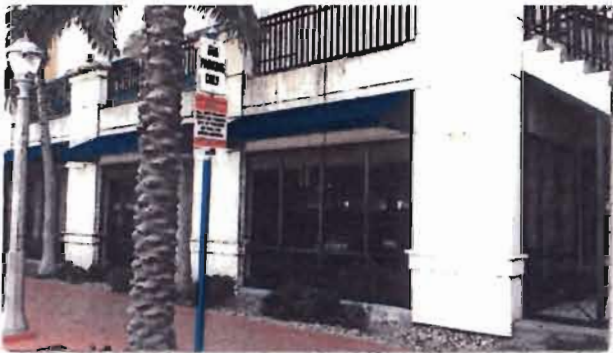
Awnings over the ground floor openings create the look of storefronts.

Below are examples where this has been accomplished successfully.