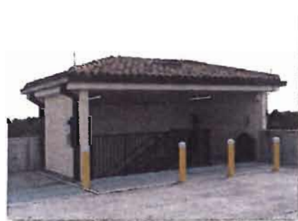
Pitch roof, roof tile and architectural design elements combine successfully.