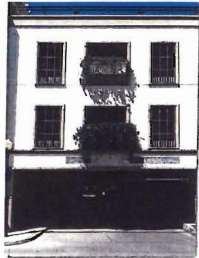
Cornice, expression lines, window boxes and window grills.