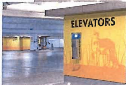
Above: Well-lighted interior provides a safe and inviting environment.