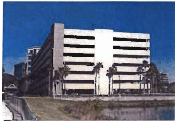
Example of precast concrete panels with minimal interest

Some members of the parking garage design community strive to produce the most cost efficient parking garage facilities for their clients that contain little or no architectural façade treatments often other than stucco or alternating paint colors. That approach is not acceptable to the City of Winter Park. To that end, these guidelines for exterior façade treatments have been adopted in order to require the mandatory inclusion of exterior and interior design components. The concept that good design costs too much is not permitted as a grounds for appeal from these parking design guidelines as exterior and interior appearance is critically important for this community.