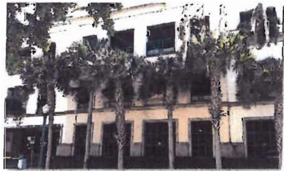
Sun Trust garage with cornice, color, window boxes, fenestration of the opening and landscape buffering combine successfully.