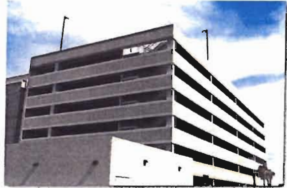
Example of minimal architectural treatment or interest

The most important factor in the success and acceptance of parking garages in Winter Park is the exterior façade design treatment. How the parking garage looks on the exterior is just as vitally important to this community as how the facility functions on the interior. These parking garage design guidelines have been adopted primarily because the parking garage design community and development partner clients have placed economies of construction over architectural design.