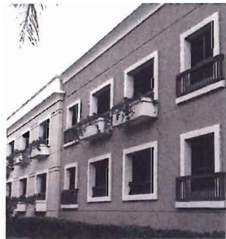
Planter boxes, window grills, protruded balconies and window framing provide the appearance of windows.