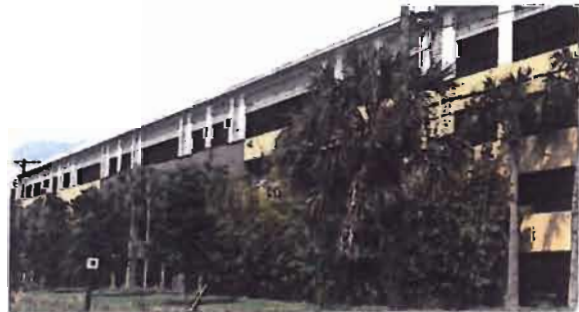
Significant landscape screening works to screen a very long wall façade of this parking garage