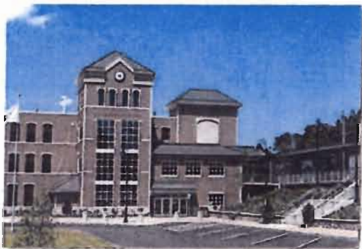
Architecture originality masks the function as a parking garage.