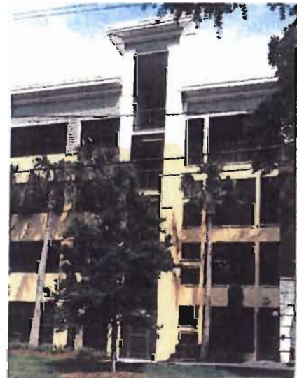
Articulation of the stair tower adds to visual appeal.