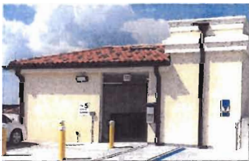
Pitch roof, roof tile and architectural design elements combine successfully.