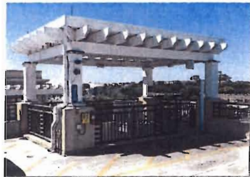
Successful incorporation of architecture for the stairway element.