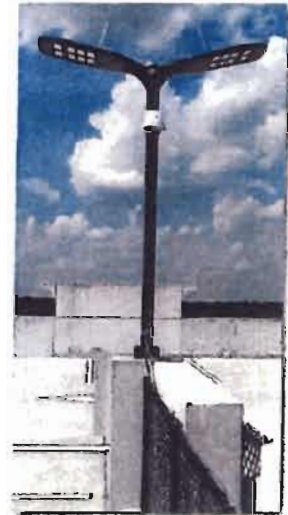
Low height poles and fixtures reduce the off-site rooftop visibility of rooftop lighting. Directional fixtures reduce light spread and meet "dark sky" requirements.