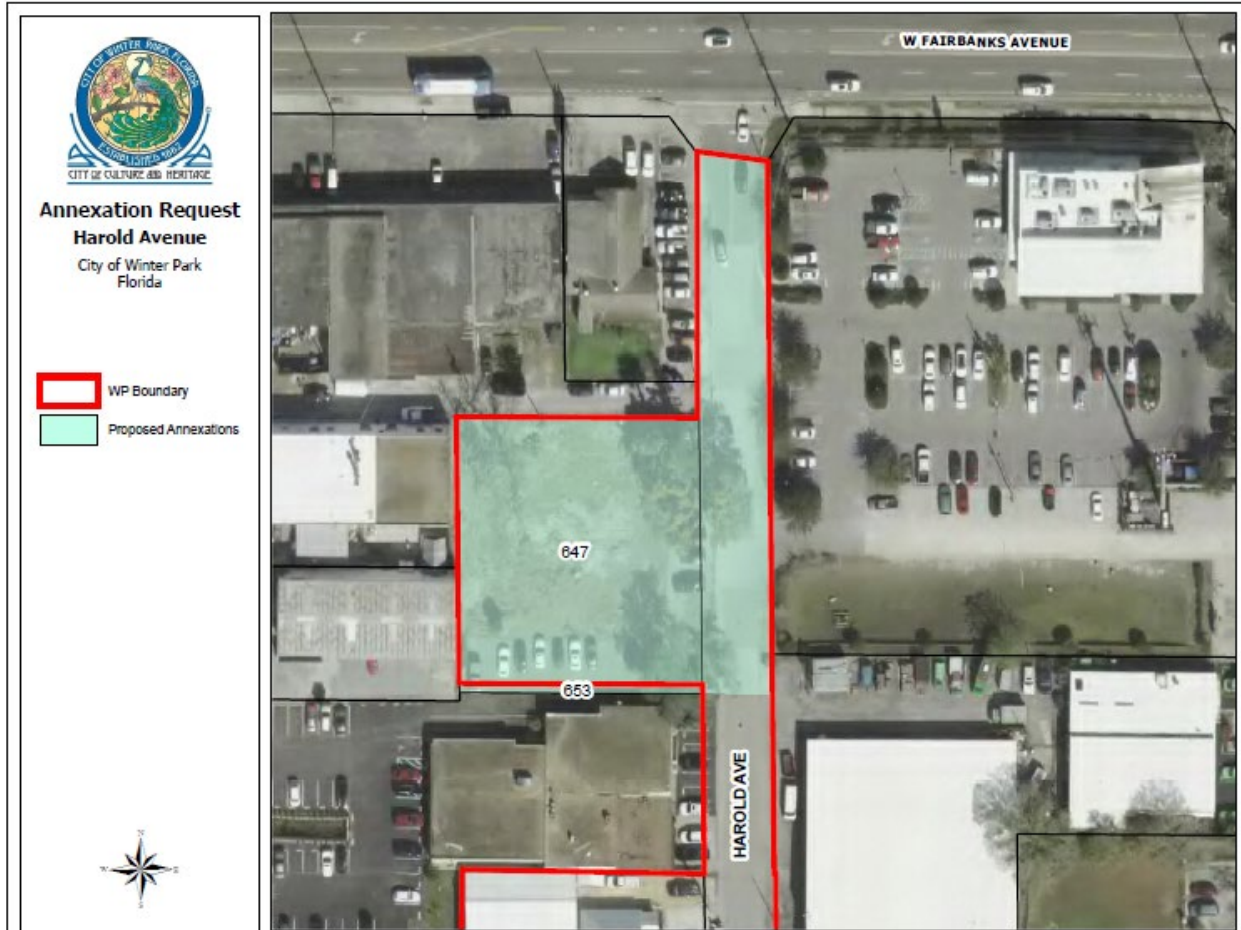
EXHIBIT "B" Map of Area to be Annexed