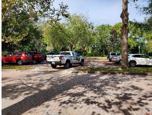
Current 'natural' lot