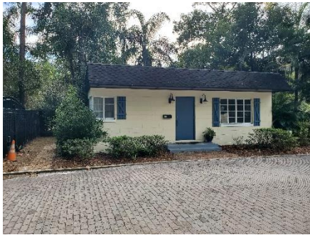
Exterior Caretakers House