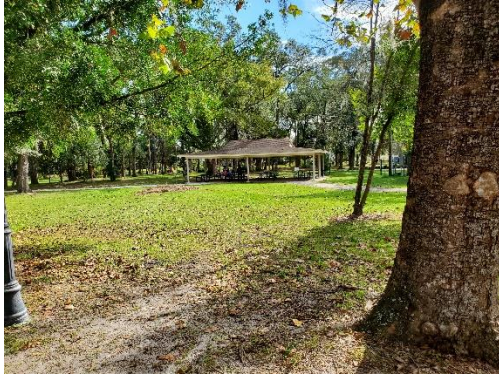
Relocation of 'natural' lot