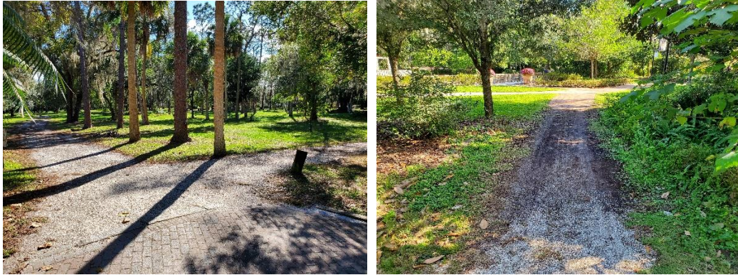
Walking Paths Current Conditions (not a complete loop or ADA friendly)