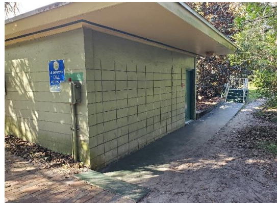
Exterior Current Changing Rooms