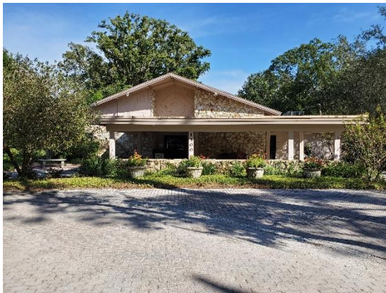
Azalea Lodge Exterior