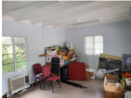
Interior Caretakers House