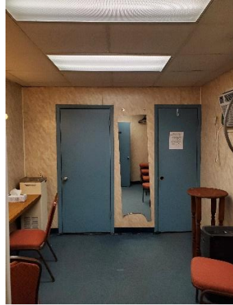
Interior Changing Rooms Current Conditions