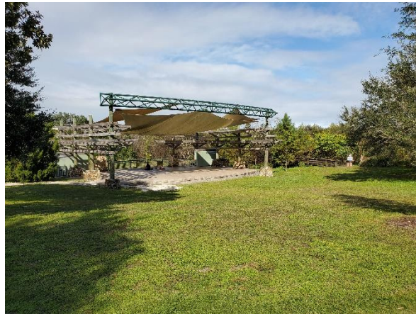
Grove Stage Area