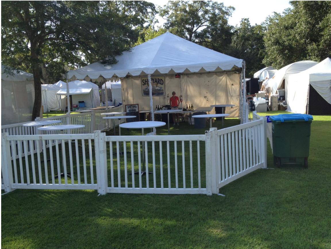
Exhibit: Beer tent from Autumn Arts Festival