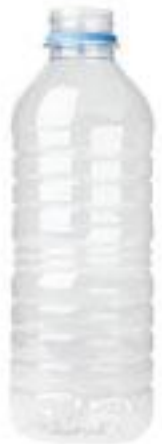
plastic bottles, jugs