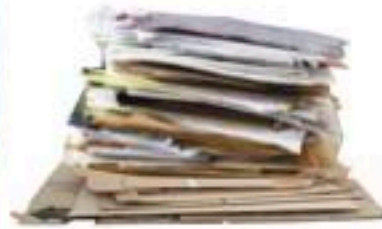
clean paper flattened cardboard