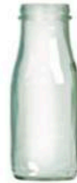
glass bottles, jars