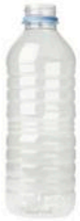
plastic bottles, jugs