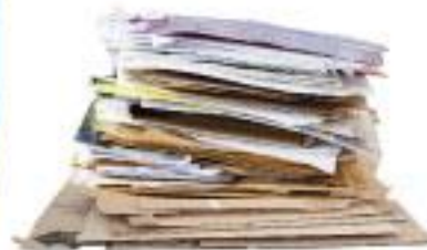
clean paper flattened cardboard