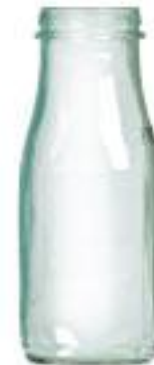
glass bottles, jars