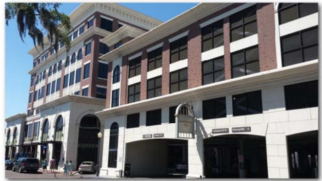
Bank of America parking garage on New England Avenue which successfully incorporates common architectural elements and design within two separated buildings as shown above and below.

One of the more successful examples of architectural compatibility is the Bank of America parking garage. These photos show examples of architectural compatibility done successfully (right).