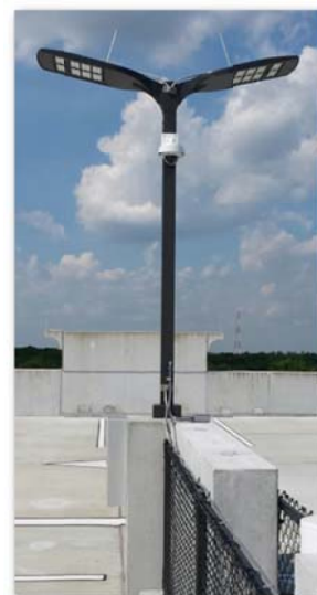
Low height poles and fixtures reduce the off-site rooftop visibility of rooftop lighting. Directional fixtures reduce light spread and meet “dark sky” requirements.