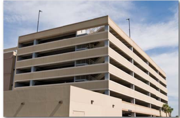
Example of minimal architectural treatment or interest

A parking garage is typically a precast concrete panel structure. If one does nothing to cover or screen the “bones” of the parking garage, then the result is parking garages that look like these pictures.