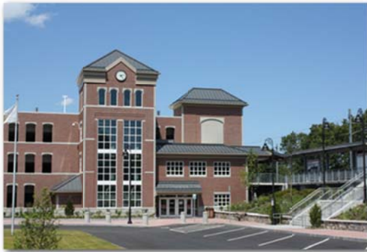
Architecture originality masks the function as a parking garage.