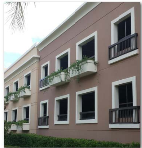
Planter boxes, window grills, protruded balconies and window framing provide the appearance of windows.