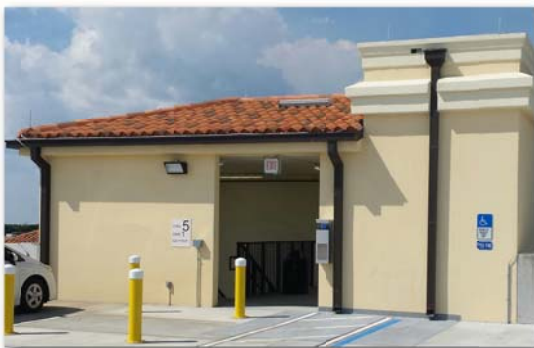
Pitch roof, roof tile and architectural design elements combine successfully.