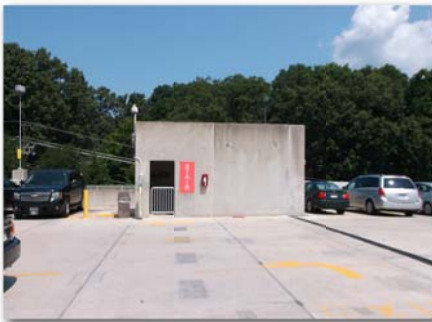
Unacceptable example with no architectural design elements.

These design guidelines shall require that the rooftop elevator and stair tower elements include architectural features such as pitched roofs, architectural materials in a fashion that compliments the overall style of the project/parking garage. Painting on the exterior of these elevator/stair towers can make a significant difference. Murals or artwork of a non-advertising nature are encouraged to be painted on the elevator stair tower interior facing walls in order to make the rooftop or interior parking garage environment more interesting and appealing. Below are pictures of the do's and don'ts for rooftops.