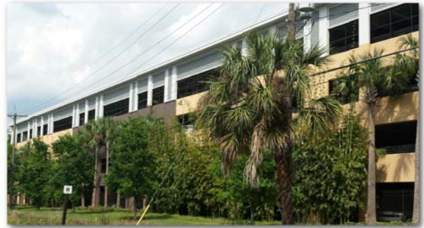
Significant landscape screening works to screen a very long wall façade of this parking garage