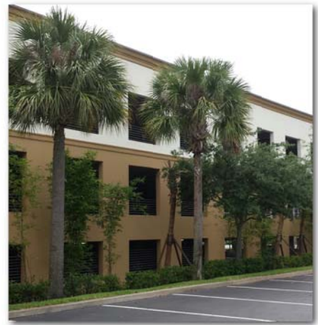
Landscape buffer screens an otherwise non-descript facade