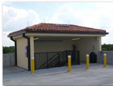
Pitch roof, roof tile and architectural design elements combine successfully.