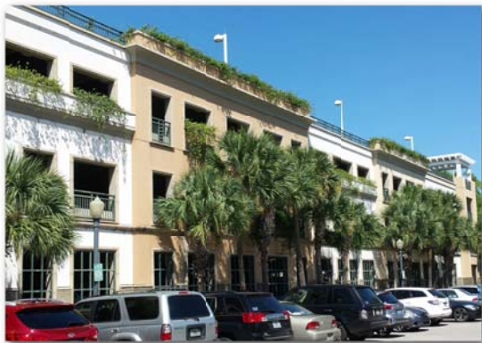
Landscaping is one element in attractive look of the Sun Trust garage.