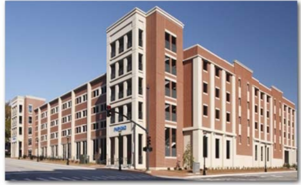
Successful articulation, color variation and window treatment for openings.