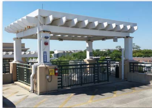
Successful incorporation of architecture for the stairway element.