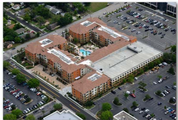
Interior location minimizes public visibility allowing landscape buffering alone to suffice.