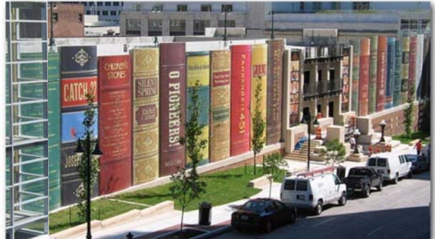
Kansas City Library which shows that a parking garage can look like anything you want it to look like.