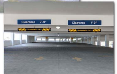
Above & below right: Note painted columns and side walls.