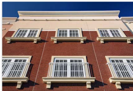
Exceptional window/opening treatments combine with cornice and color.