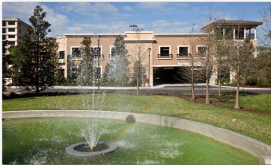
WP Towers garage with cornice, articulation, stair tower, window fenestration, planter boxes and opening framing details combine successfully.