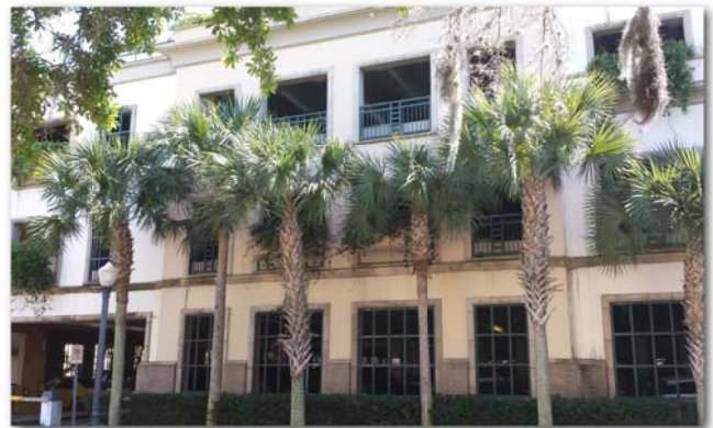
Cornice, expression line and larger ground floor windows resembling storefront windows add to the visual appeal.