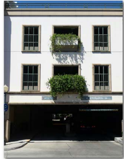
Cornice, expression lines, window boxes and window grills.