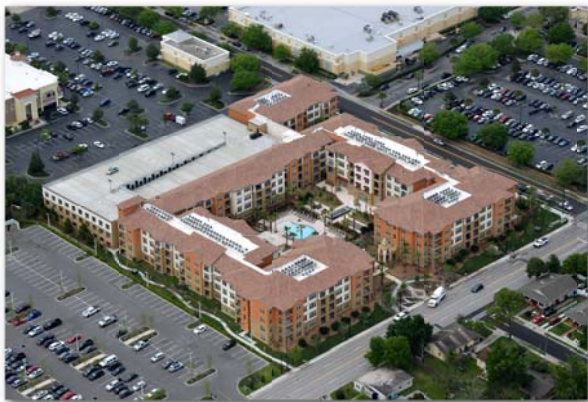
Location is not visible from public streets so the exterior façade may exclude design treatment.

In these types of circumstances and only in these situations, the City may, by specific approval, allow the use of more limited exterior façade design treatments than those outlined and required within these parking garage design guidelines. Designers should consult with the planning staff to determine whether the location criteria will apply that can result in less than a complete application of these design guidelines. Otherwise for parking garages facing public streets or visible thereto, the mandatory design elements within the guidelines shall be required.