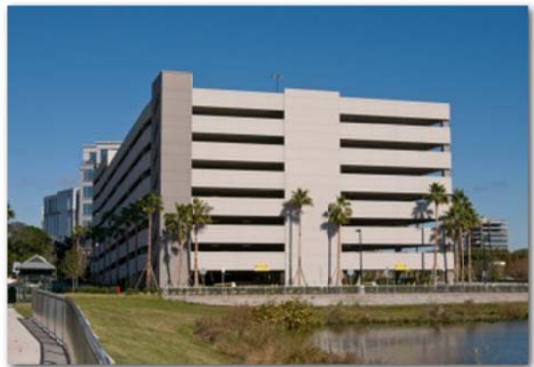
Example of precast concrete panels with minimal interest