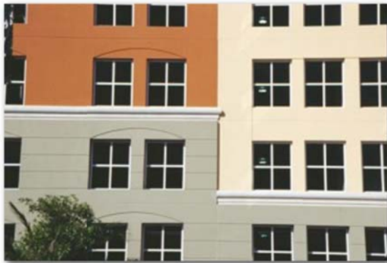
Articulation, color changes, expression lines and window grills combine successfully.

Included below are some pictures that illustrate this done successfully, along with other examples of design elements that are not permitted.