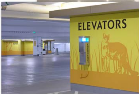
Above: Well-lighted interior provides a safe and inviting environment.