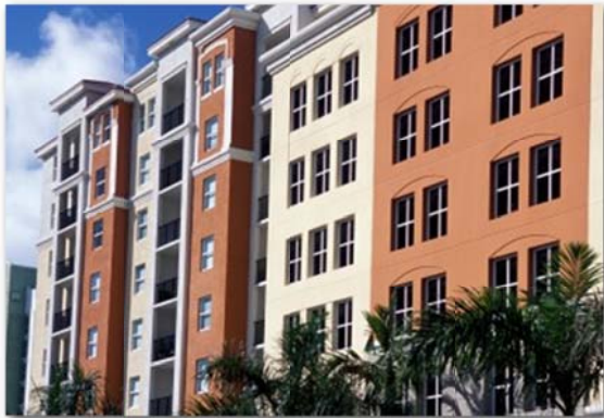
Building wall articulation (in's and out's) and color variation adds to the visual appeal.

In order to provide aesthetic interest, the exterior shall contain a variety of materials and colors. Below are some pictures that illustrate this done successfully of design elements not permitted.