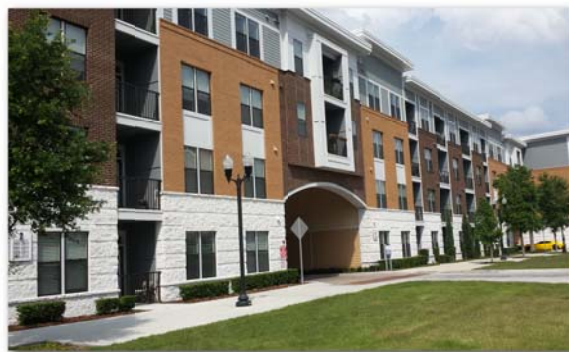
Steelhouse Apartments on Colonial Drive with parking garage shown in the photo to the right.