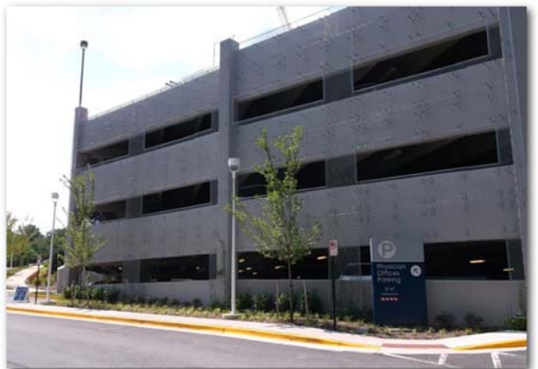
Example of cost being the sole design motivation