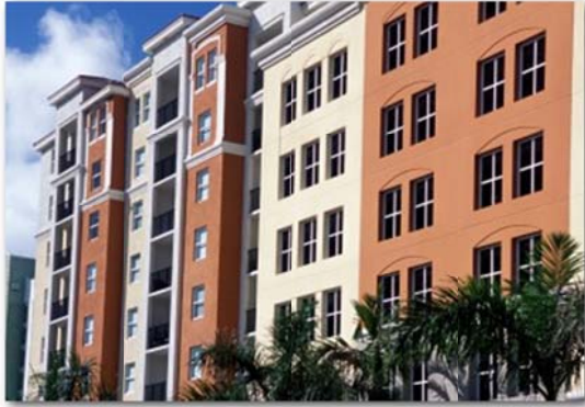
Successful articulation, color variation and window treatment for openings.