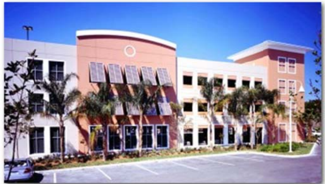
Awnings or shutters over upper floor opening create the look of an office building.