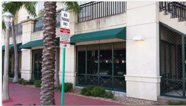
Awnings over the ground floor openings create the look of storefronts.

Below are examples where this has been accomplished successfully.