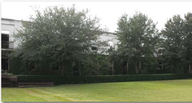
Mature oak trees screen the view of the garage

Below are pictures of successful examples within Winter Park where the use of landscaping/trees successfully screens the view of the parking garage by landscape elements.