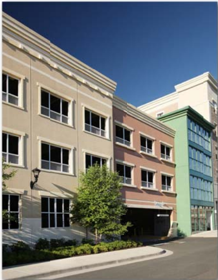
Articulation and color variation adds to the visual appeal.