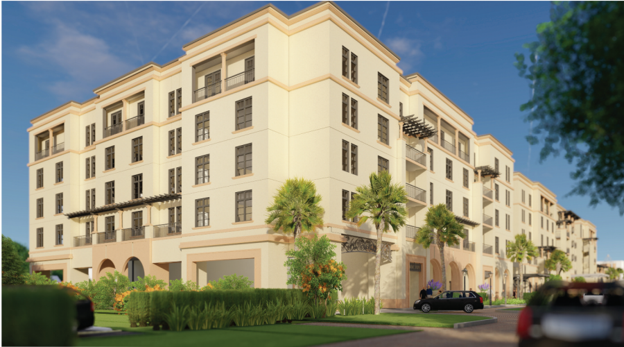
view from New England Avenue looking west