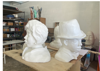
Enlargements from original clay sculpture